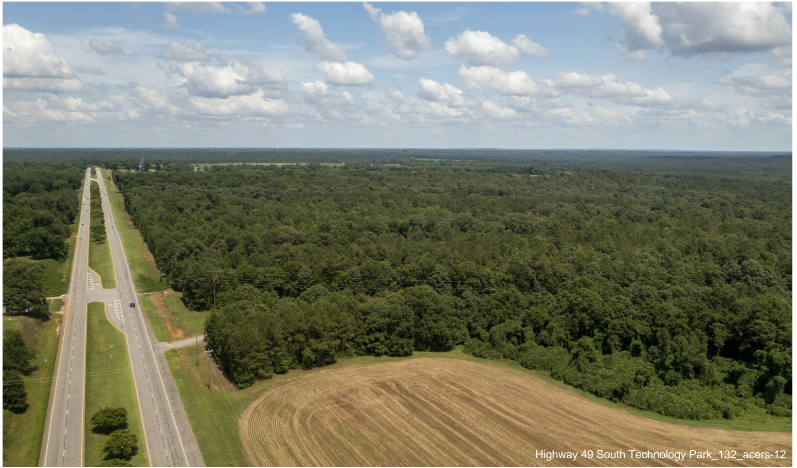
Highway 49 South Technology Park_132_acers-12