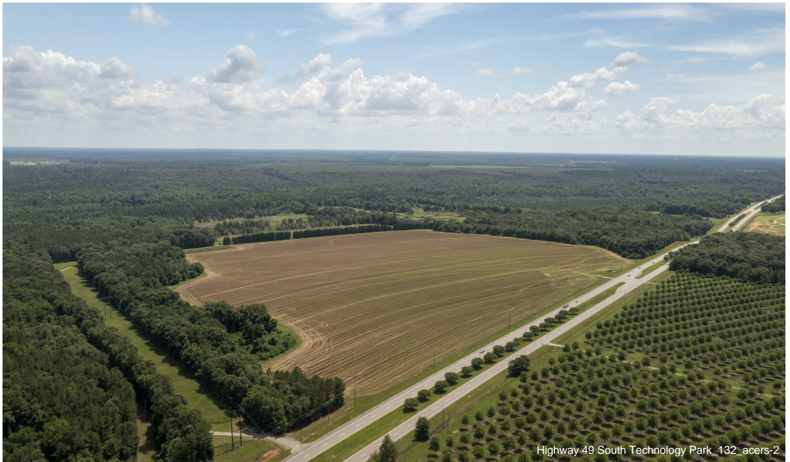
Highway 49 South Technology Park_132_acers-2