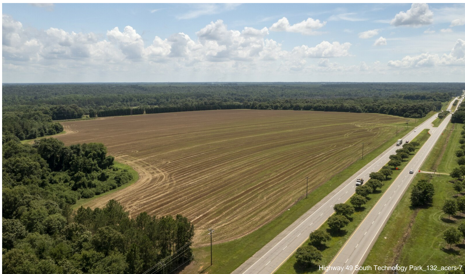
Highway 49 South Technology Park_132_acers-7