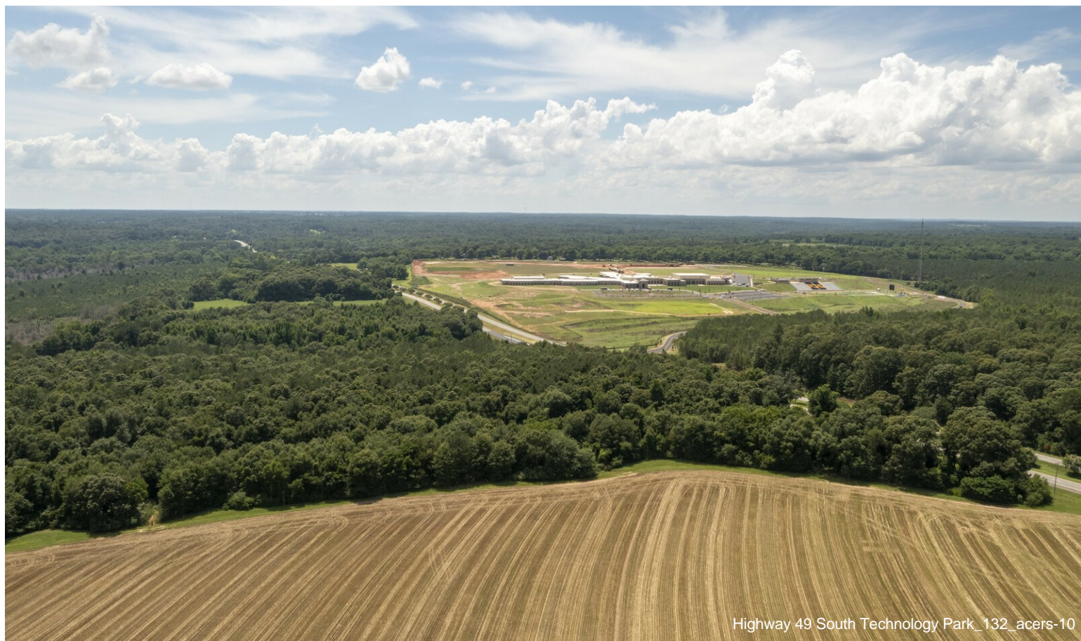
Highway 49 South Technology Park_132_acers-10