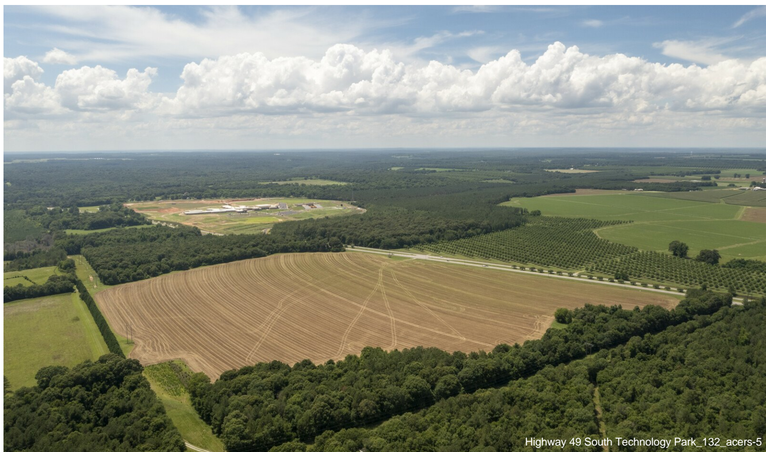
Highway 49 South Technology Park_132_acers-5