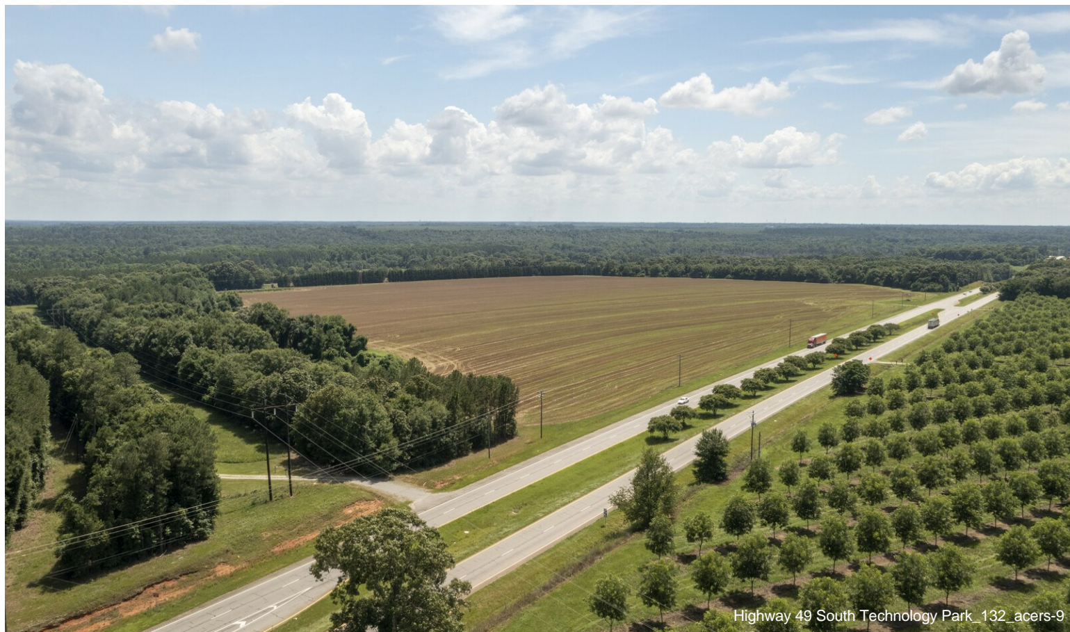
Highway 49 South Technology Park_132_acers-9