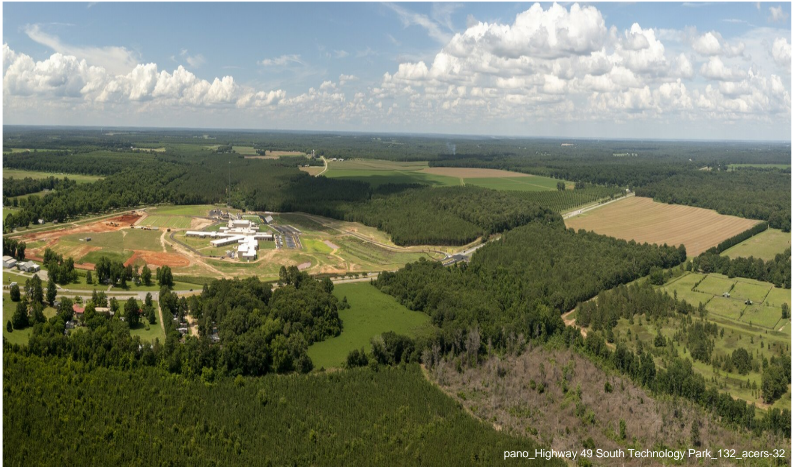
pano_Highway 49 South Technology Park_132_acers-32