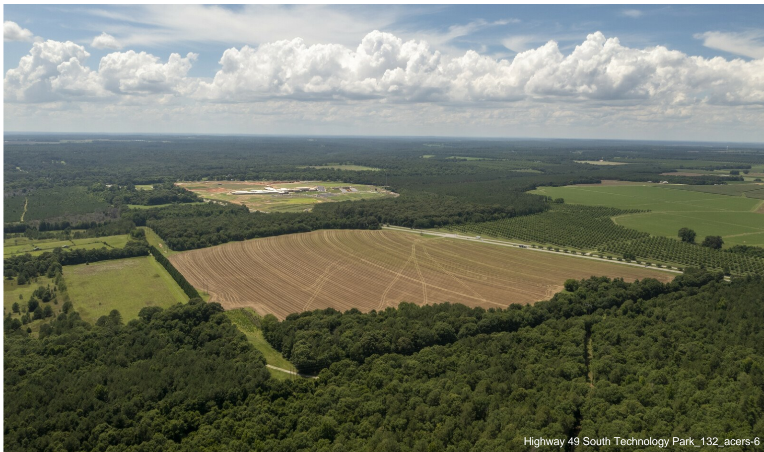
Highway 49 South Technology Park_132_acers-6