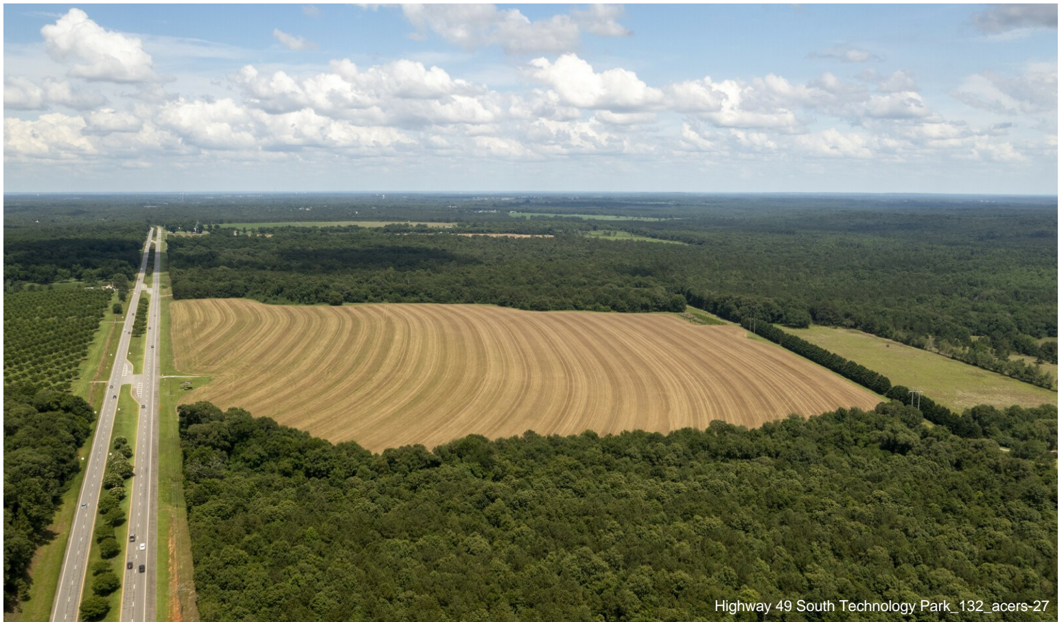
Highway 49 South Technology Park_132_acers-27