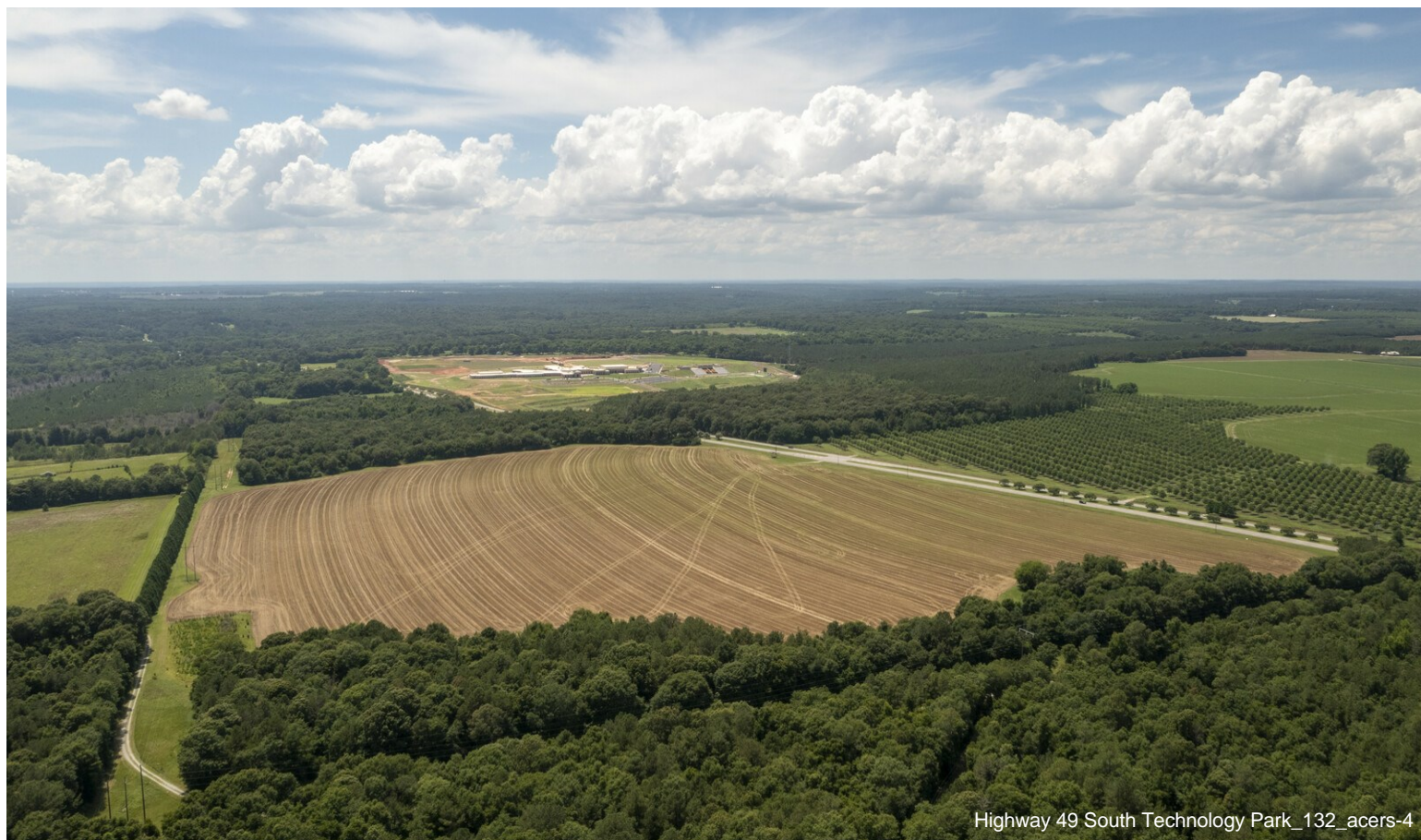
Highway 49 South Technology Park_132_acers-4