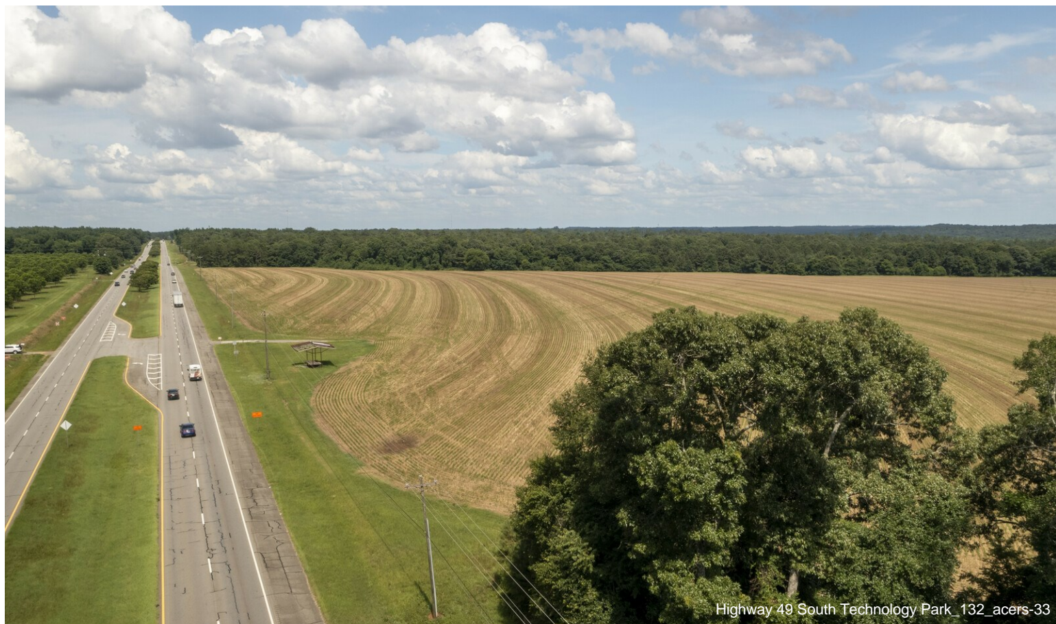
Highway 49 South Technology Park_132_acers-33