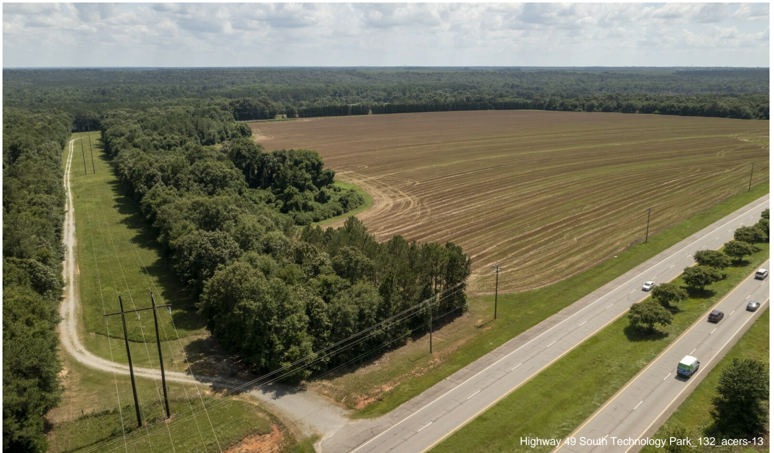
Highway 49 South Technology Park_132_acers-13