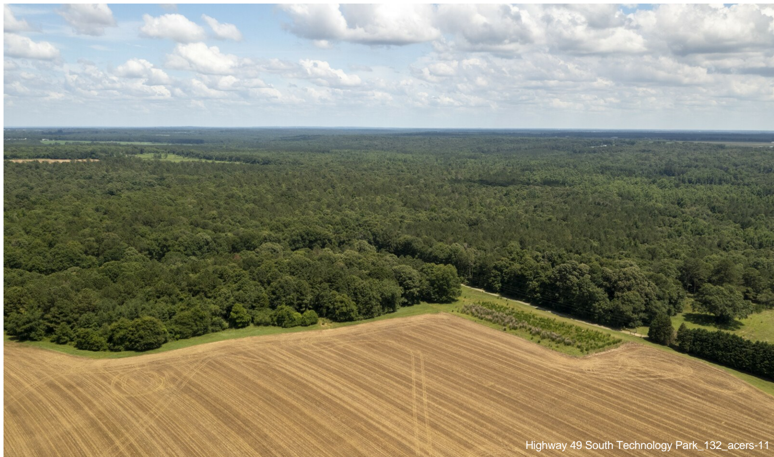
Highway 49 South Technology Park_132_acers-11