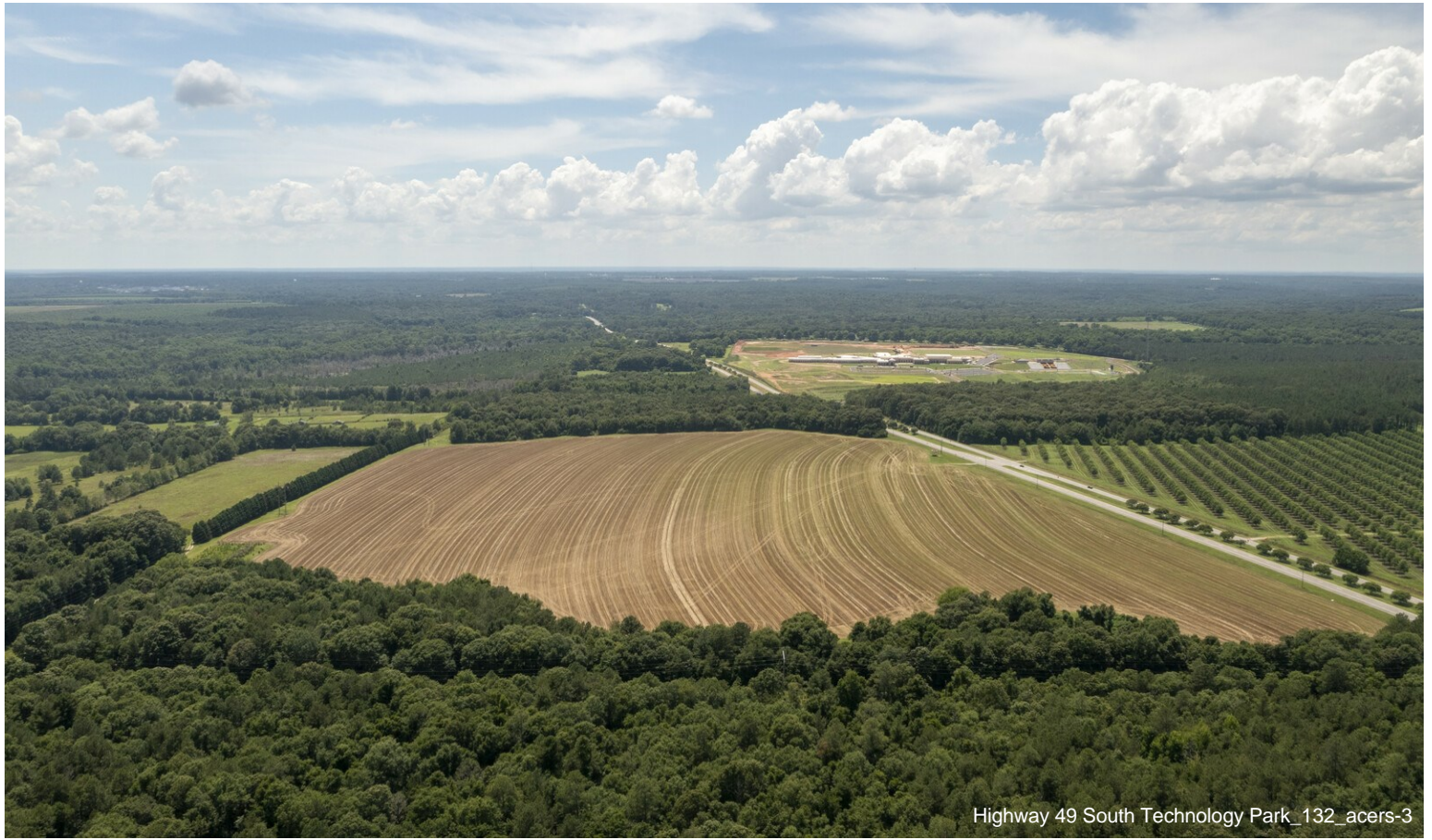
Highway 49 South Technology Park_132_acers-3