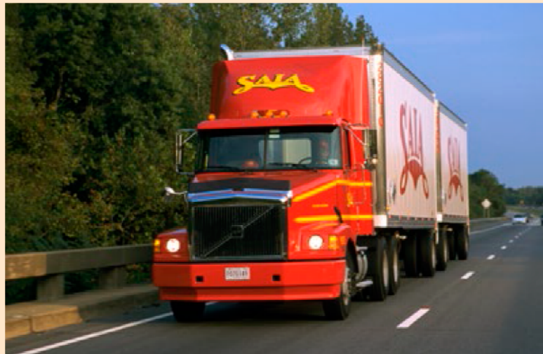
Saia recently launched two new service groups, Saia TL Plus and Saia Logistics Services. Each group offers unique services that complement each other well, and add the core capabilities that allow the transportation company to continue to grow and succeed in Georgia.