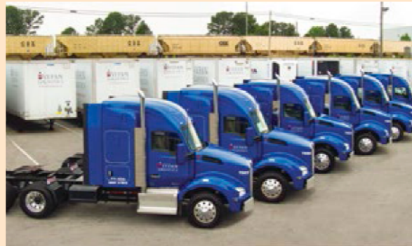
Located in a bustling poultry-industry region of north Georgia, Syfan Logistics specializes in hauling time-sensitive, perishable food products.

As fiber optic cable continues to expand to every corner of Georgia, communications are not only faster, but more transparent as well. GPS tracking systems allow shippers to pinpoint the status of their freight at any given minute. Email, texting, and social media keep us connected to our customers and drivers like never before. Meanwhile, the Internet and advanced software systems have allowed us to be more efficient while expanding the borders of our business operations and territory. Technology will never replace networking and relationships, but it sure has made it easier to stay in touch and in tune with our customers and partners.