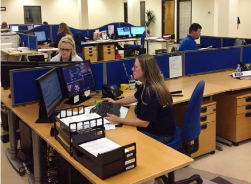
HWC Logistics' dedicated professionals take the time to completely understand their customers' business. Then they recommend a seamless solution based on HWC's integrated logistics service capabilities.

Another business with close ties to the Port of Savannah is JIT Warehousing and Logistics. Located one half-mile from the