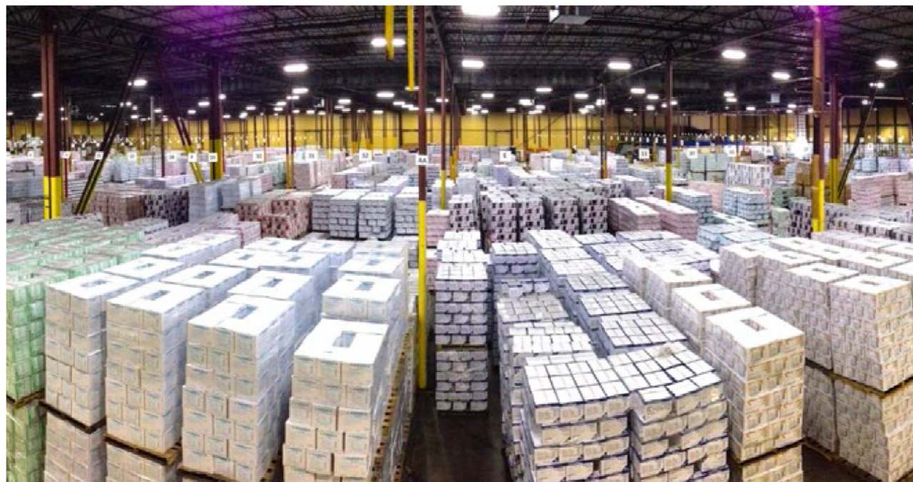
HWC Logistics offers close to one million square feet of warehousing space spread over three locations—Atlanta and Savannah, Ga., and Charlotte, N.C. Warehousing services include transloads, cross-docking, and heavyweight freight, as well as short- and long-term storage.