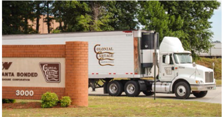
Its metro-Atlanta location helps Atlanta Bonded Warehouse Corporation, and its in-house carrier Colonial Cartage, provide public and contract food-grade, temperature-controlled distribution services that satisfy even stringent shipper requirements.

ABW operates nine warehouses across the southeastern United States, comprising 2.5 million square feet of dry and