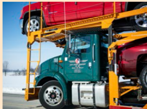
Jack Cooper Transport finds Georgia is a particularly good location for serving the automotive industry.

As competition for site selection heats up around the United States, Jack Cooper believes Georgia can stay competitive by positioning itself as an optimal hub for Southeast automotive and logistics operations, and continuing to offer economic benefits and incentives to companies looking to relocate or start up in the region.