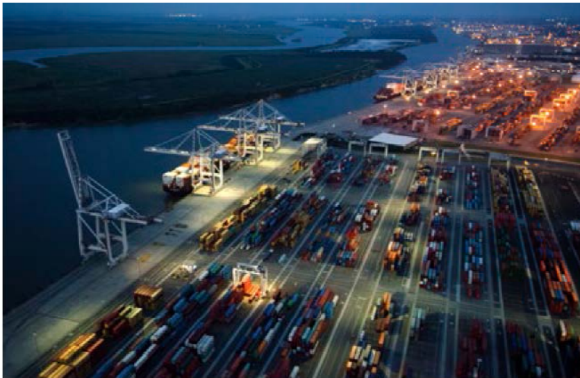
Ocean shippers are attracted to the Ports of Savannah and Brunswick for good reason. As the U.S.’s fourth-busiest container port, the Port of Savannah offers more shipping services than any port in the Southeast.