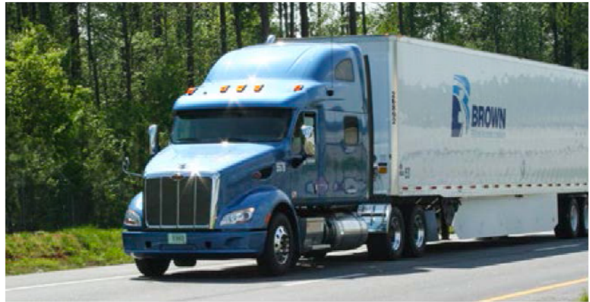
With corporate offices in Lithonia, Ga., Brown Integrated Logistics provides a suite of logistics services, including dedicated trucking and third-party logistics, through its four subsidiaries.

For shippers, NTG serves as a kind of matchmaker, working with smaller carriers to provide capacity.