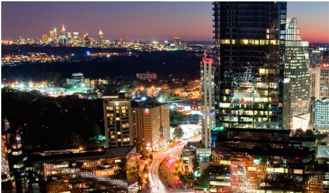
MAKING THE GRADE. Atlanta is one of the "friendliest" cities in the country for small businesses, earning an A- in a survey of small business owners conducted for Thumbtack.com, and the Ewing Marion Kauffman Foundation.

Today, Georgia is not so much a terminus as a center point from which roads, rail lines, and ocean and air routes radiate across the United States and around the world. Two interstate highways—I-75 and I-95—connect Georgia with the southernmost and northernmost reaches of the United States. Another four interstates—I-16, I-20, I-59, and I-85—put